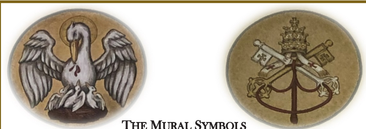
THE MURAL SYMBOLS

PELICAN – In medieval Europe, the pelican was thought to be particularly attentive to her young, to the point of providing her own blood by wounding her own breast when no other food was available. As a result, the pelican became a symbol of the Passion of Jesus and of the Eucharist since about the 12th century.